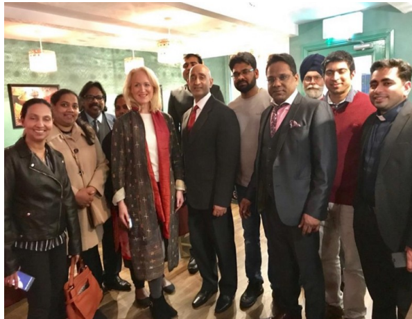
With members of Indian community