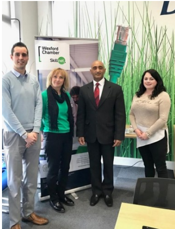
With representatives of Wexford Chamber of Commerce